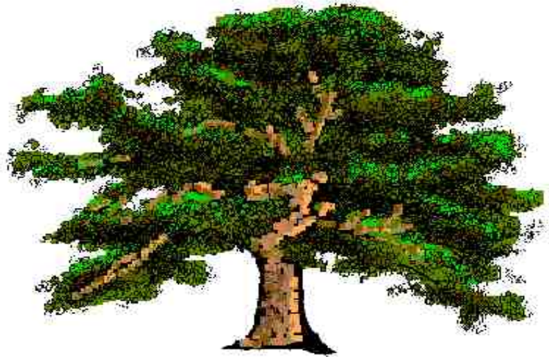
The right tree, in the right location, equals long term success!

Get the hose out and water your trees, shrubs and lawn!